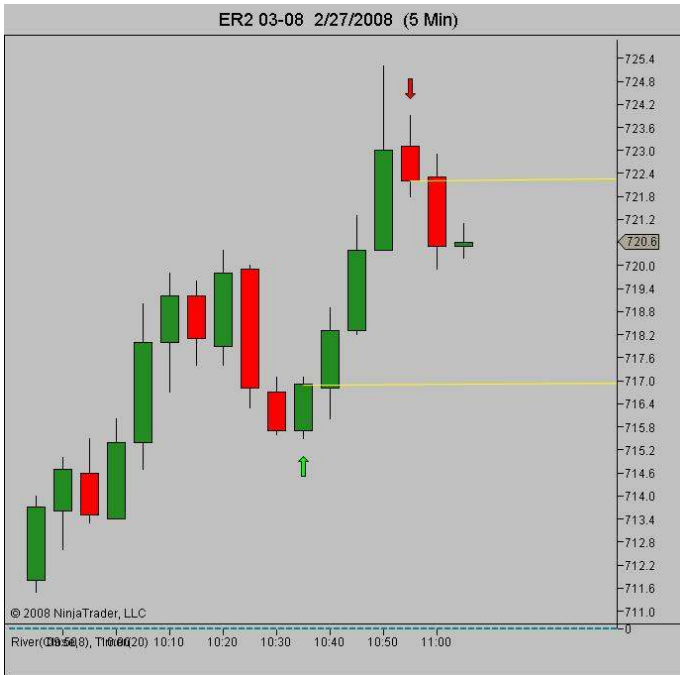
Chart 4: Emini Russell 2000, 53 Ticks per contract ($530.00) in 20 minutes....