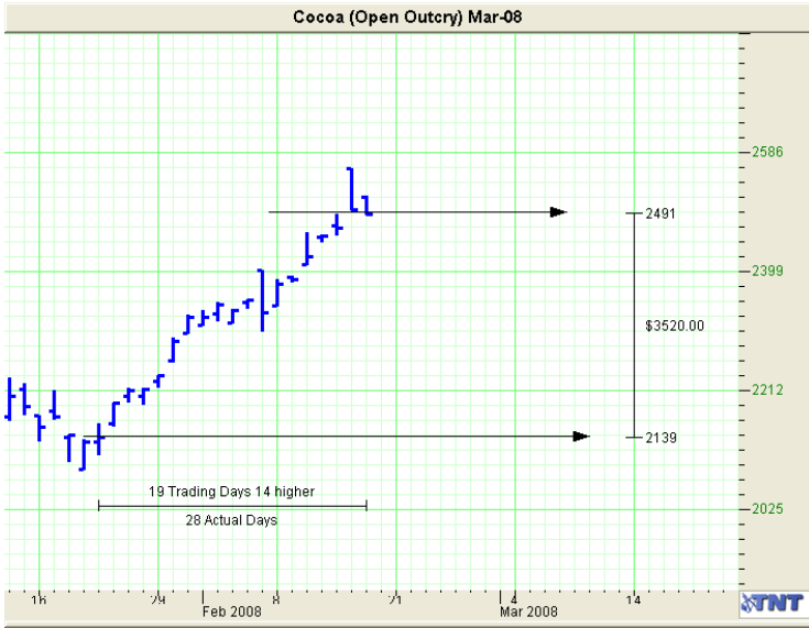
Chart 3: March 08 Cocoa, 352 points per contract ($3,520.00) in 28 days. Not random.